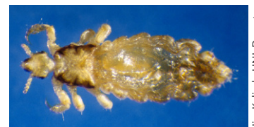
Magnified adult louse, which are the size of sesame seeds.

Adults — Adult lice are 1/16–1/8-inch long, wingless, brown-colored insects. They have pincher-like claws allowing them to firmly grasp hair shaft.