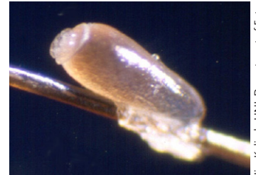
Egg or nit attached to hair shaft.

Viable eggs — Eggs (aka nits) are less than 1/32-inch long, light brown/yellow/white, oval-shaped, and are glued to one side of the hair shaft. Lice eggs are located no more than 1/4 inch from the scalp and are common at the nape of the neck and close to ears.