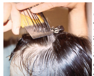
Some instructions include combing hair to remove lice and nits.

In addition, there is a variety of FDA-approved pediculicides (lice killers) sold over-the-counter or as a prescription treatment (see table on next page). These products are safe and effective when used as directed.