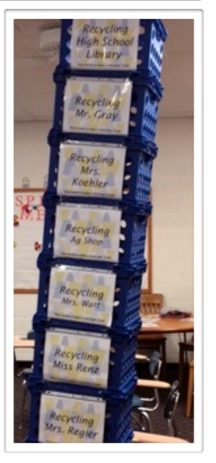
Recycling totes for the classrooms