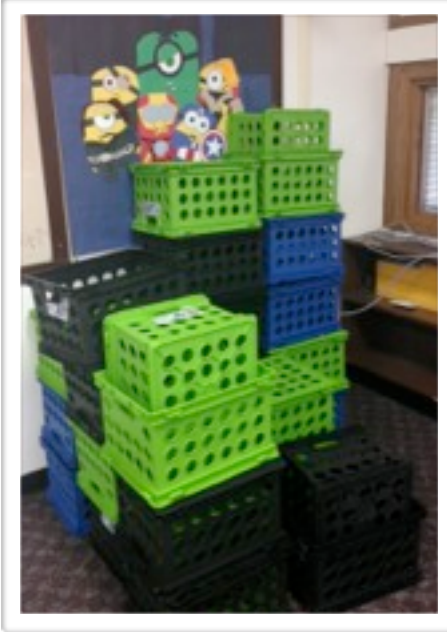
New totes were purchased to replace the old recycling boxes.