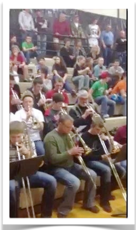
The Alumni Pep-Band Performing at the Doniphan-Trumbull Basketball Game.