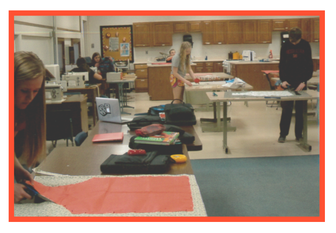
8th Grade students cutting out their aprons.