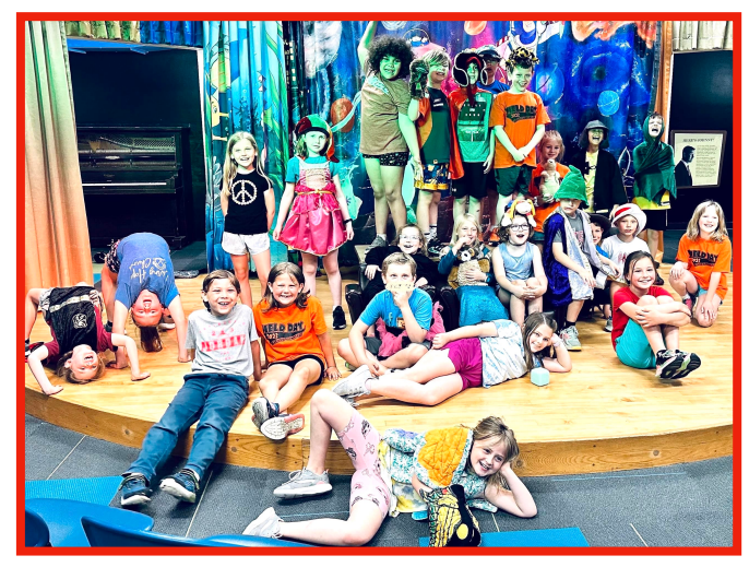
The second grade class enjoyed a fun day at the Lincoln Children's Museum!