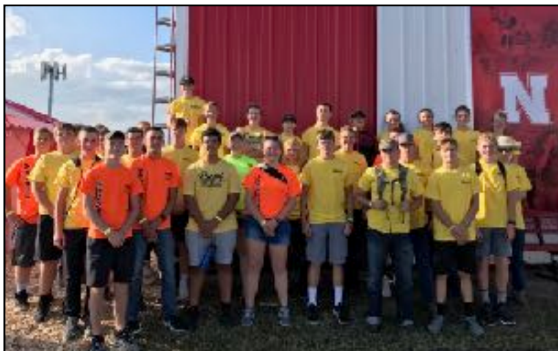
FFA Members at Husker Harvest Days